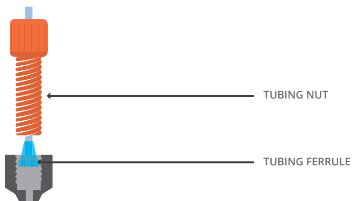
Luer Lock Mechanism

The luer lock nut and ferrule should be positioned on the tubing according to the diagram below: