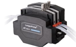
DG15-24 DG15-28 DG15-48