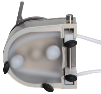
Cytoflow 2-Roller Pump Heads