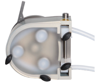
Cytoflow 3-Roller Pump Heads