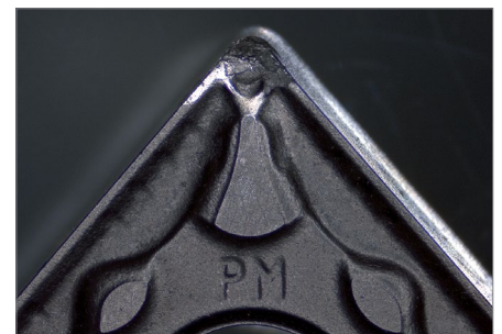
Indexable insert, shows tool wear. Reflected light, ringlight, zoom 0.8x