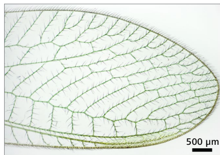
Green lacewing Transmitted light bright field